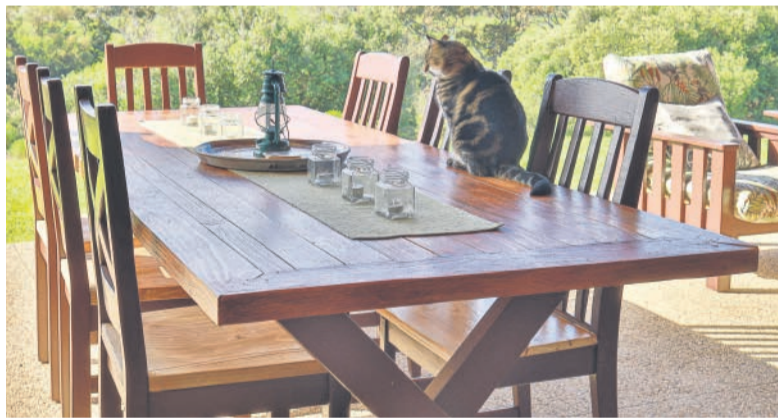
MASTER OF THE HOUSE: Yoda is the resident cat at Stanford Heights River House.

As much as you might feel like the lord of the manor when renting the home, it's the resident cat Yoda who rules this roost. Originally a rescue cat, she follows