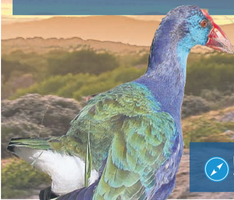
COLOURFUL: The water-dwelling Gallinule is one of the birds you can see on the cruise down the Stanford River.

For more information visit www.capenature.co.za