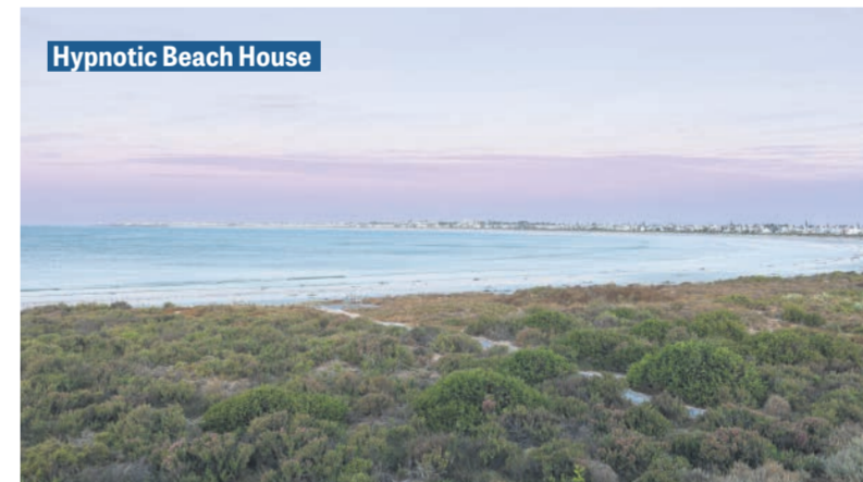
Hypnotic Beach House

horizon. An intense pull made me envision a home here, a space where family bonds would grow stronger amid the backdrop of nature's splendour.