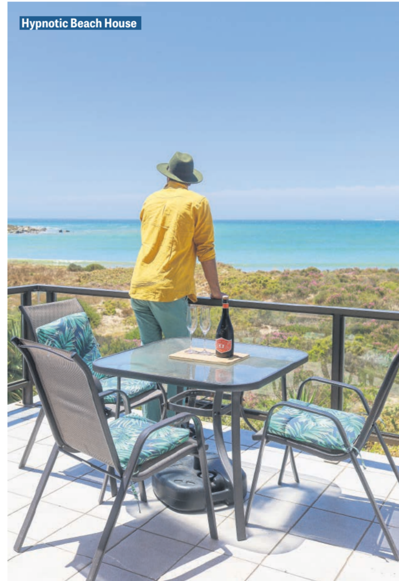
Hypnotic Beach House

BENGUELA COVE, BRITANNIA BAY, PATERNOSTER