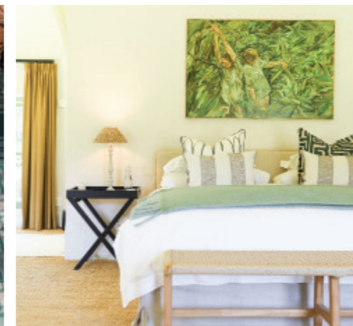
LEFT & ABOVE: Nestled in the Hemel-en-Aarde Valley, Moya's Vineyard is a picturesque exclusive-use vineyard, accommodating up to 20 guests